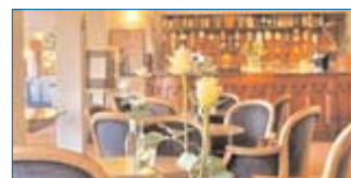
Hotel California, Pentire, Newquay

The Hotel California is a traditional hotel, located in a quiet residential area of Newquay. Tucked away from the hustle and bustle of town yet only a short walk away from the beautiful beaches and the variety of gift shops and high street favourites in the town, it is set in an unrivalled location. The hotel has an indoor and outdoor heated swimming pool which is free to hotel residents.