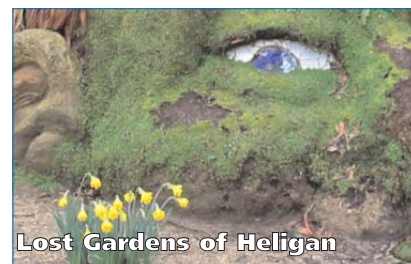
Lost Gardens of Heligan